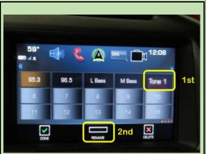
Press Preset to Change- Then Rename