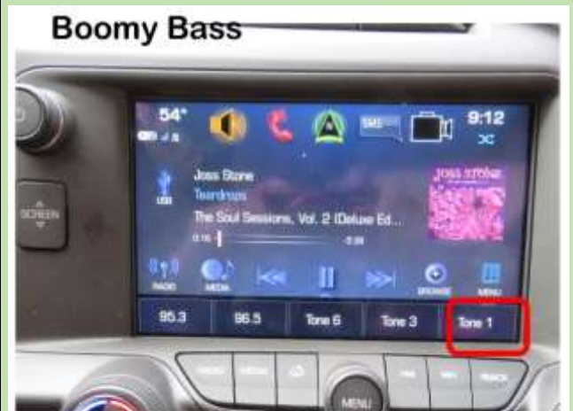
Standard Tone Settings #1

Just pull up the preset Buttons while on the Tone/Balance screen, then Press a Button as when storing a radio channel! It will beep and be automatically labeled Tone 1.