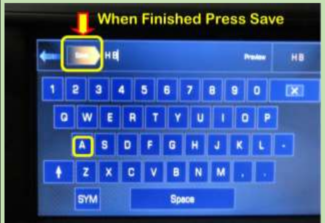
Press Desired Letters/Symbols and Save