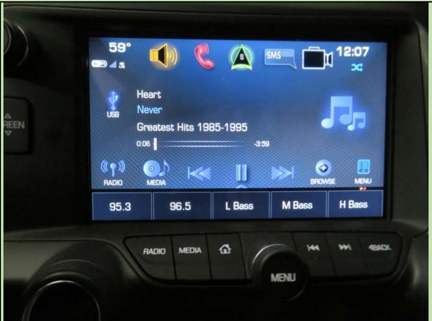
BACK TO AUDIO SCREEN