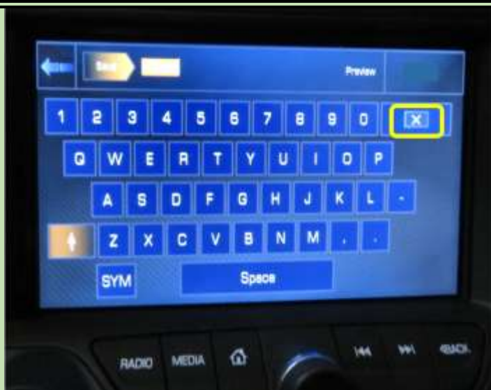
Press X, Which is Backspace, Clears Name