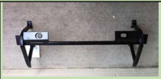
Photo right is a bottom view of what GM refers to as a “radiator support” for a C7 (also called a skid pad) that bolts into the frame below the radiator. It is the low point after the flexible air dam. Unlike the air dam it is not designed to move! This picture is from eBay where it can be purchased for $195.

This is a picture the manufacturer sent me when they were in stock, as I had inquired about when it would be available even before I received the Corvette in early October! You can see that this 1/8 inch thick HD plastic fits over the low portion of the skid pad. Unlike aluminum, the plastic has a low friction surface. On their web site, www.saccitycorvette.com they show a Corvette moving and sliding up and over a cement parking stop! For the C7 they are selling the glued version versus both it and the screw-on type they also sell for older Vettes. After reviewing their video, I thought the glued-on approach would be fine.