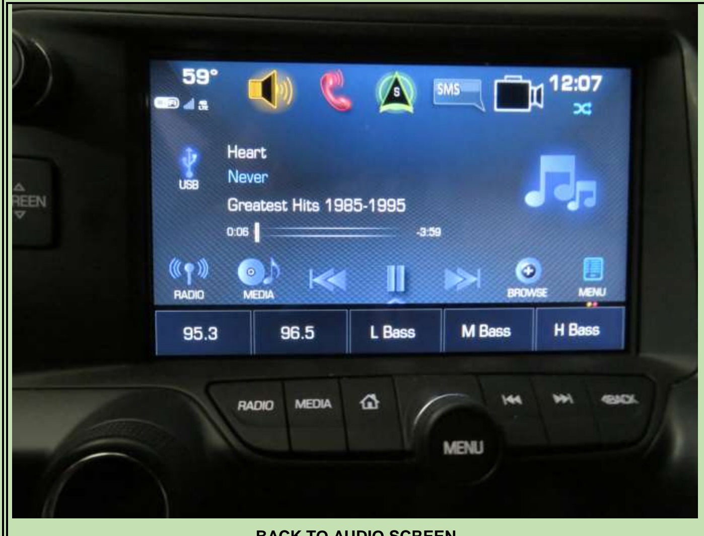
BACK TO AUDIO SCREEN