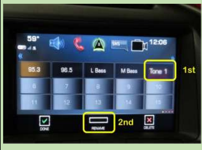
Press Preset to Change- Then Rename