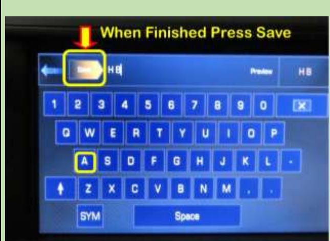
Press Desired Letters/Symbols and Save