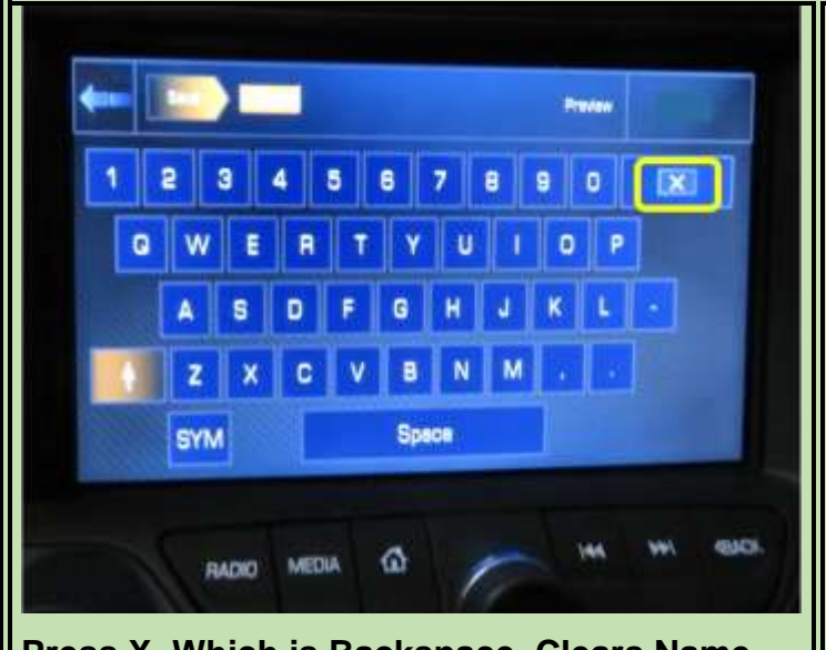
Press X, Which is Backspace, Clears Name