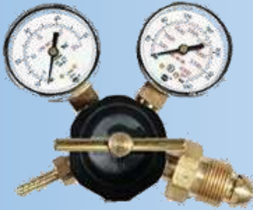
Newer Regulator/Flowgauge on Miller 211 & Hobart Handler