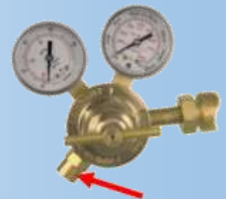
CGA "B" Female 032 Fitting