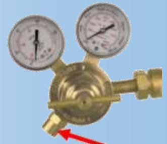
CGA “B” Female 032 Fitting

NOTE: The threaded section is NOT a pipe thread! DON'T USE TEFLON TAPE! A piece could cover part of seat. The nut just tightens the metal seats.