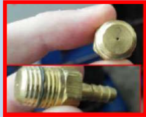
That Hose Barb MUST Remain

There are a few US made products that use hose barbs unlike most Victor, Harris or a majority of Miller/Smith that use a female CGA "B" fitting as they use on their welders.