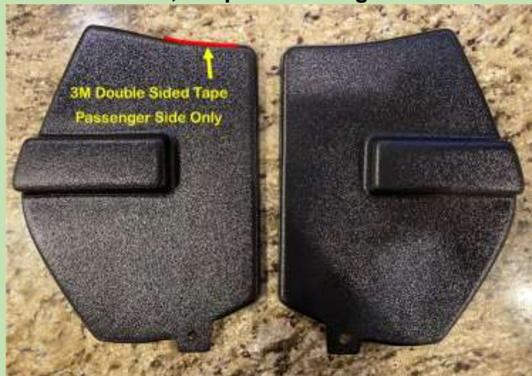
3M Double Sided Tape Passenger Side Only

over the tower. ARO suggests watching the video on their website. The one from them for the non-MRC is straight forward. The one for MRC is from a customer review. It may be an earlier product. In addition, the person doing the install said he didn't use the supplied wire tie though the hole in the passenger side cover and thought the small amount of 3M Double Side Tape that is only on half the side that mounts to the back panel was sufficient. No way! I have the MRC model and used the supplied wire tie and 3M tape.