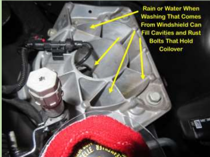
Rain or Water When Washing That Comes From Windshield Can Fill Cavities and Rust Bolts That Hold Coilover

Water draining from the windshield goes into the cowl and can run down over the Coilover cast aluminum tower structure. Forum Members have posted the water has rusted the coilover bolts. Some have removed 6 or more ounces of water from the deep cavities.